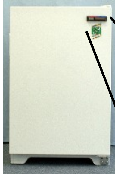
All Freezer (shown with optional LCD display)