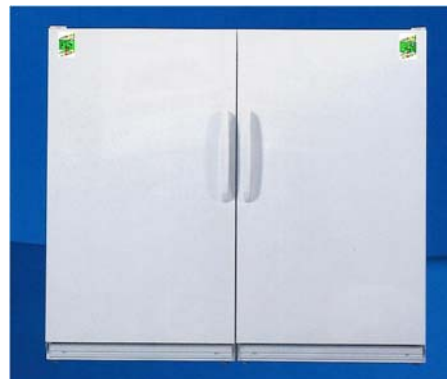
Refrigerator above shown with companion -20 freezer